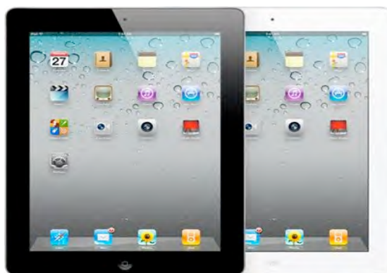
iPad 2 with Wi Fi iPad 2 with Wi Fi and 3G