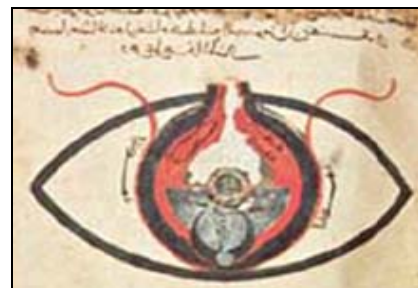
Book of the Ten Treatises on the Eye by Hanayn ibn Ishāq, 9 th century