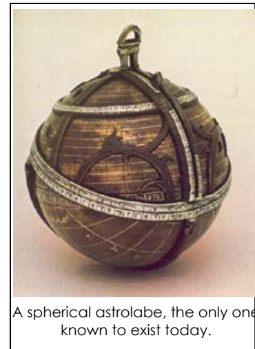
A spherical astrolabe, the only one known to exist today.