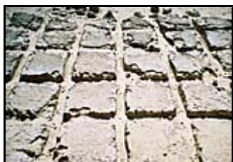
A quarry floor showing quarrying marks made by the ancient Egyptians

There has been much debate concerning the techniques used by ancient Egyptians to cut and dress rough-quarried granite boulders or blocks for use in masonry. No remnants of the actual drilling equipment