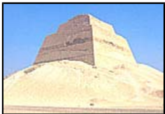
The Meidum Pyramid

Most archaeologists agree that a system of ramps must have been used to drag the millions of blocks into their positions in the various pyramids. No such ramps have actually survived at the Great Pyramid itself, but enough traces can be seen around some of the other Old Kingdom pyramids to suggest that at least five different systems of ramp might have been used.