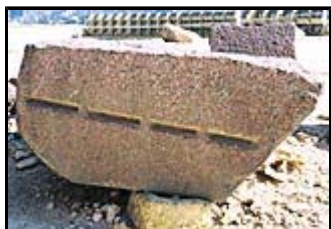
Pink granite from the pyramid of Khafra at Giza

The King's Chamber was made entirely from blocks of Aswan granite. Since the Second Dynasty, granite had frequently been used in the construction of royal tombs. The burial chambers and corridors of many pyramids from the Third to the Twelfth Dynasty were lined with pink granite, and some pyramids were also given granite external casing (eg those of Khafra and Menkaura, at Giza) or granite pyramidia (cap-stones).