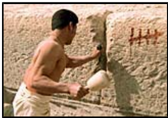
A reconstruction of a pyramid-worker chiselling stone in a quarry

Since at least the time of the ancient Greeks, there has been considerable debate about exactly how the Egyptians constructed King Khufu's Great Pyramid at Giza.