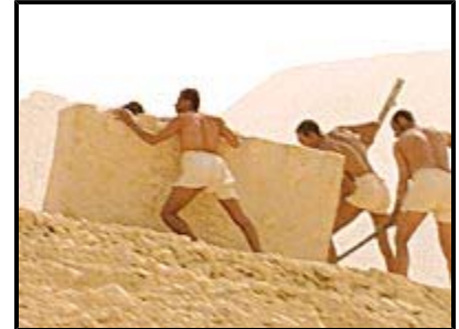
A reconstruction of pyramid-builders hauling a pyramid block

The recent robotic explorations of the 'air-shafts' in the Great Pyramid have demonstrated that there are still many mysteries surrounding the ancient monument. Ian Shaw discusses the debate around the building of the great structure and investigates the methods used in its construction.